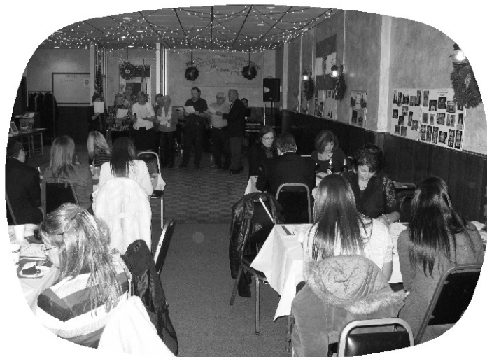
Guests at St. Nick Banquet