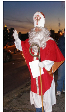
Special Guest Visit By Saint Nicholas

Doors open at 5 PM Hot Dinner Buffet at 6 PM